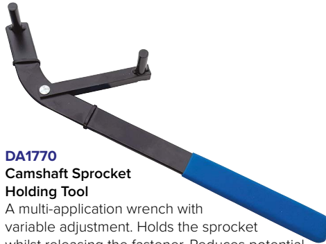
DA1770 Camshaft Sprocket Holding Tool

For separating ball joints, this tool uses the forked wedge principle. Designed to be used with a hammer separate the joint from the steering arm. Fork dimensions: internal 14mm, thickness of shaft 22mm, overall length 200mm. Manufactured to ANSI and DIN standards.