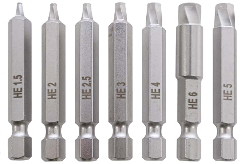
DA7355 Damaged Hex Bolt Extractor

A multi-application wrench with variable adjustment. Holds the sprocket whilst releasing the fastener. Reduces potential damage to camshaft. Designed to allow the sprocket to be held still whilst undoing fixings.