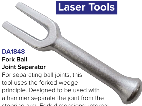
DA1848 Fork Ball Joint Separator

For separating ball joints, this tool uses the forked wedge principle. Designed to be used with a hammer separate the joint from the steering arm. Fork dimensions: internal 14mm, thickness of shaft 22mm, overall length 200mm. Manufactured to ANSI and DIN standards.