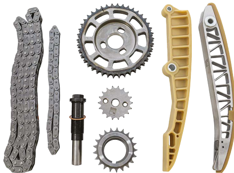
DA3799 FAI kit - Defender & Discovery 2 - Td5 Engine pre-fix - 15P to 19P Kit contains guides, chains, tensioner & sprockets