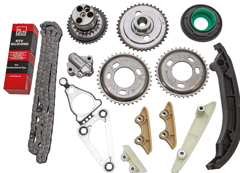
DA3907 FAI kit - Defender - 2007 - 2016 - 2.2 engines Kit contains guides, chain, tensioner, sprockets & gasket