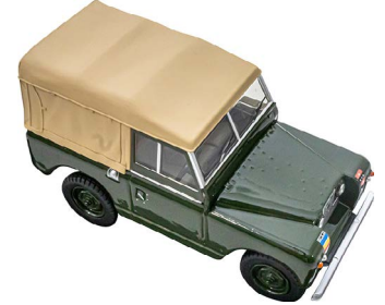
1:76 Fuji White