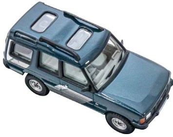
DA3917 Discovery 1