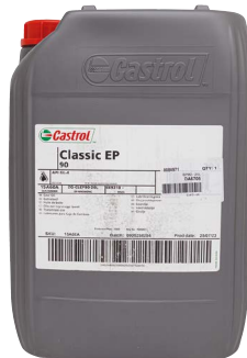
DA6705 EP90 Extreme Pressure API GL4 20 litre drum Extreme pressure multi-purpose gear oil for hypoid and non-hypoid applications