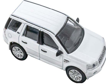
DA3918 Freelander 2