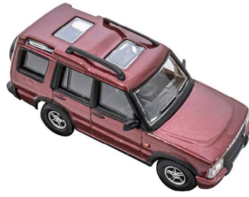
DA3909 Discovery 2