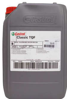
DA6706 TQF 20 litre drum Transmission fluid for automatic gearboxes, incorporating additives to provide wear, oxidation and corrosion resistance